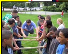
Outdoor Ed Team-Building